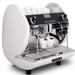
CARAT ECO MINI 1 GROUP