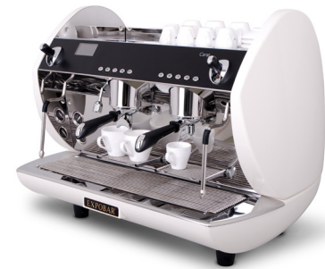
CARAT ECO 2 GROUP