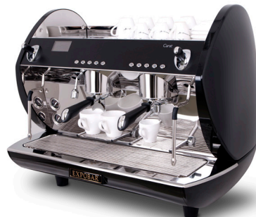
CARAT ECO 2 GROUP